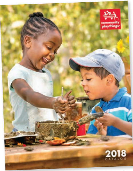
Community Playthings Catalog

Manufacturers of solid maple furniture and toys for over 65 years